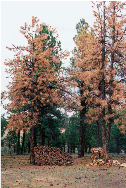
Storing cut firewood near susceptible trees greatly increases the risk of ips beetle attack.