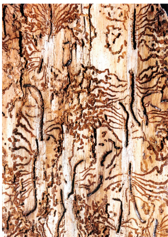
Tunneling by Ips hunteri in blue spruce.

Note: Concentrations of insecticides used to control bark beetles are often considerably greater than those used for insects on foliage. To avoid needle burning, try to limit the application to the bark, particularly when using liquid (emulsifiable concentrate) formulations that have increased risk of causing plant injuries.