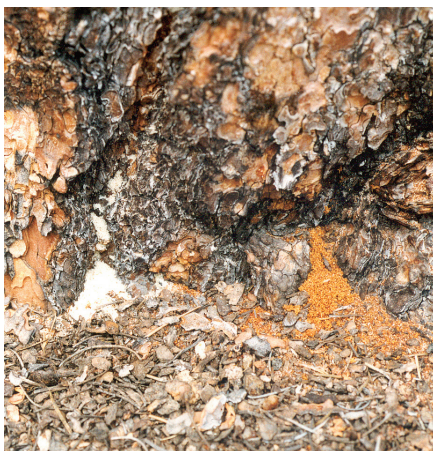
Boring dust at the base of a pine tree. Reddish boring dust is caused by ips beetles. The whitish dust is from ambrosia bark beetles.