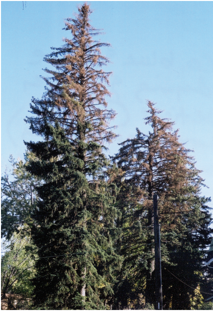
Top dieback of spruce from drought stress and ips attack.