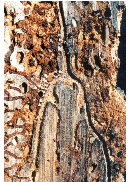
Ips pini egg galleries under bark of ponderosa pine trunk.

Colorado State University, U.S. Department of Agriculture, and Colorado counties cooperating. CSU Extension programs are available to all without discrimination. No endorsement of products mentioned is intended nor is criticism implied of products not mentioned.