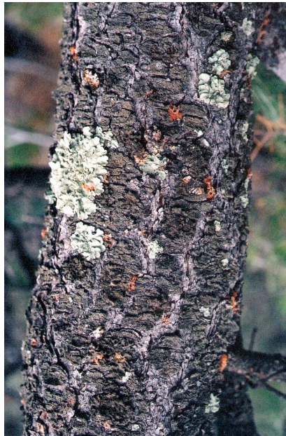
Ips confusus pitch tubes on infested pinyon pine trunk.

No chemical treatment exists for trees or wood already infested by ips beetles. In rare cases where it is feasible to reduce the threat to live trees by killing beetles within infested trees before they exit, treatments involve bark removal, chipping the wood into small pieces, covering piles with a double-layer of 6-mil thick clear plastic sealed around the edges with soil to heat (solarize) the wood, or physical removal of infested material from the site to an area a mile or more from susceptible trees.